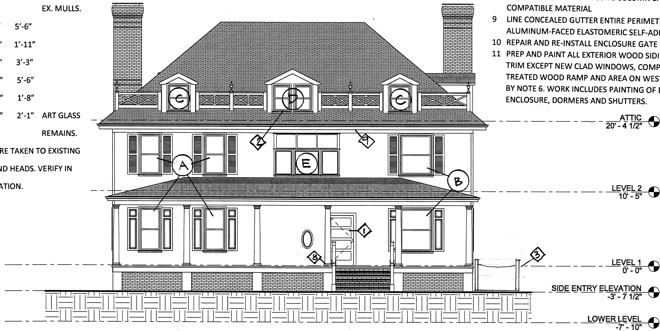
1 EAST ELEVATION 1/8" = 1'-0"

NOTE: DIMENSIONS ARE TAKEN TO EXISTING JAMB LINERS, SILLS AND HEADS. VERIFY IN FIELD BEFORE FABRICATION.