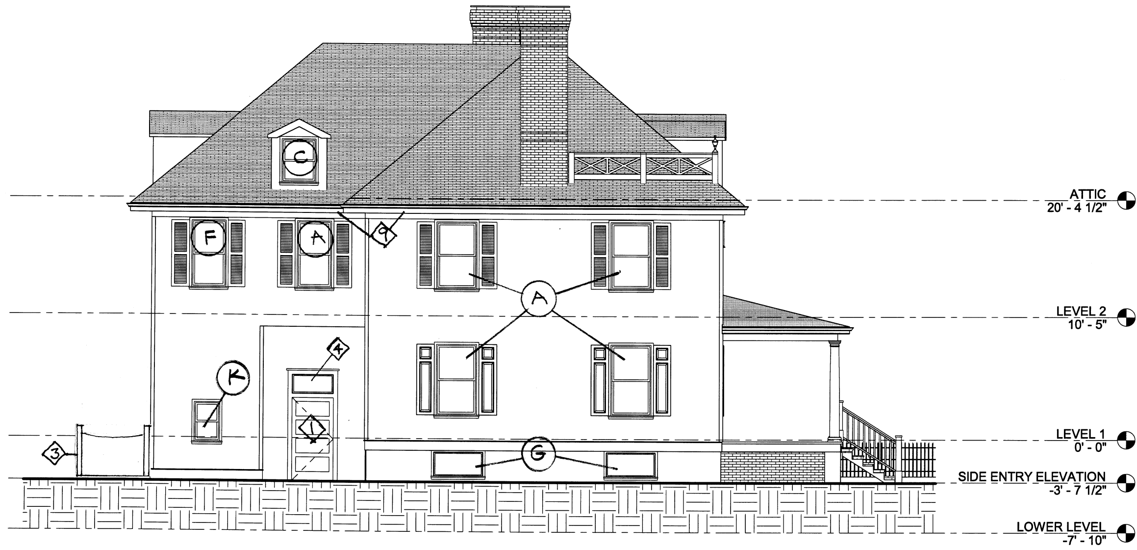
① SOUTH ELEVATION 1/8" = 1'-0"